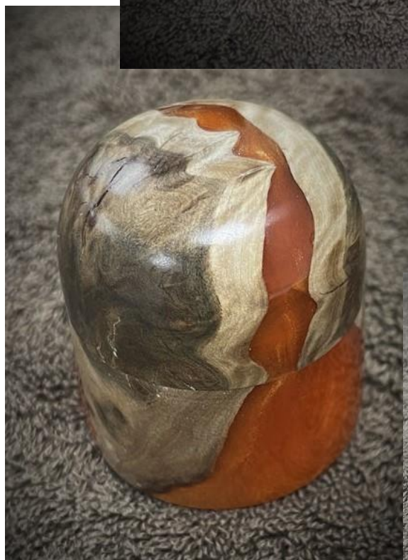
Skip Wilbur (All)