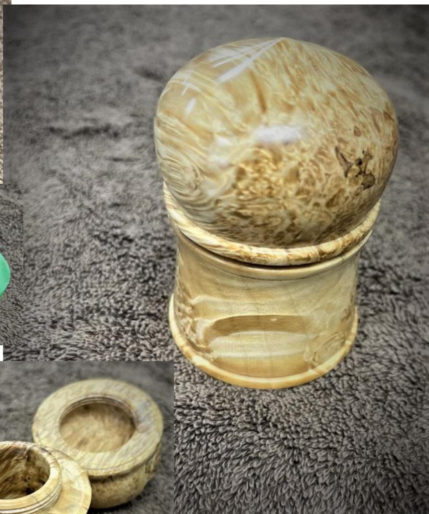
Skip Wilbur (All)