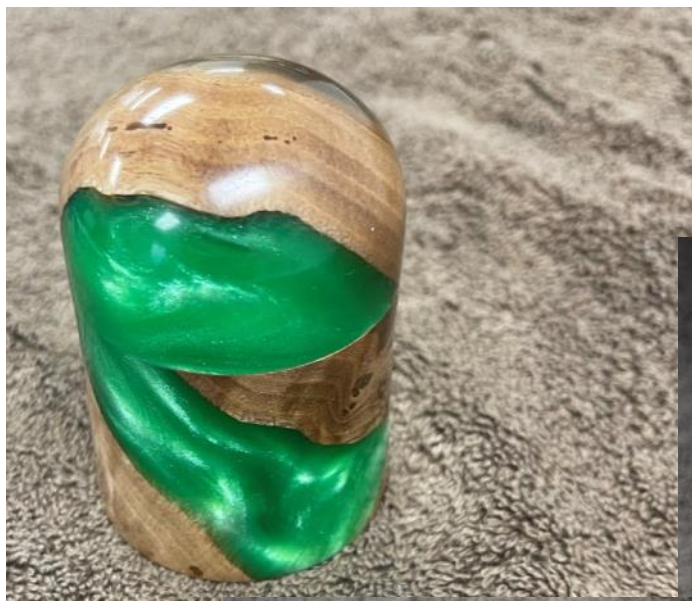
Burl in Acrylic