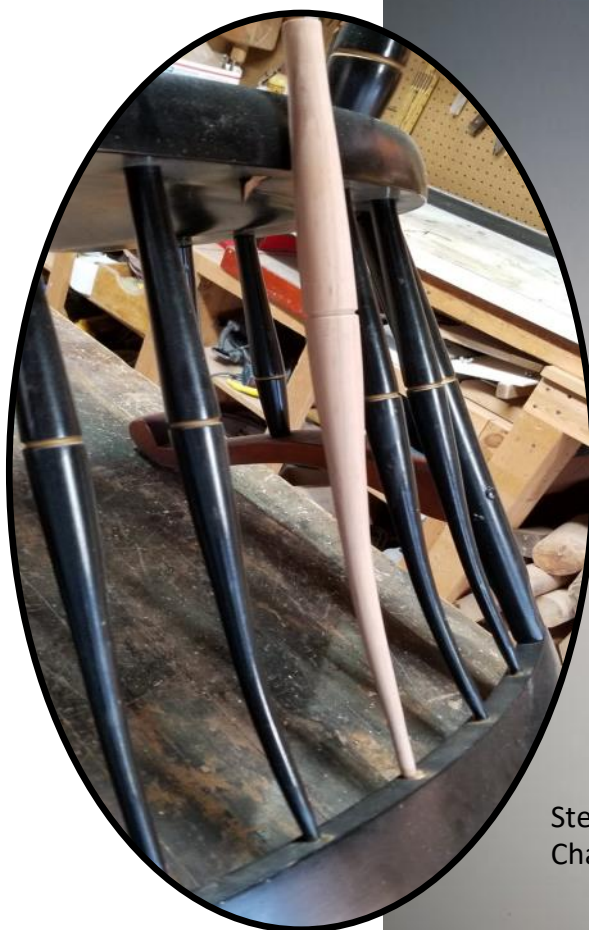
Steam-bent Chair Spindle