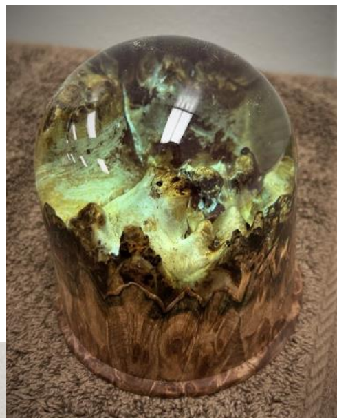
Burl in Acrylic