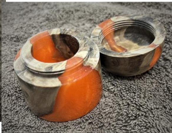
Burl in Acrylic