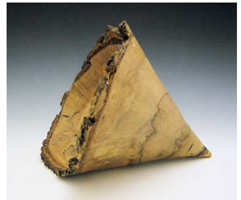
Dennis Paullus - Oak burr