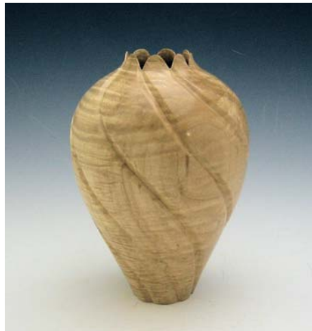
Terry Reynolds - Maple