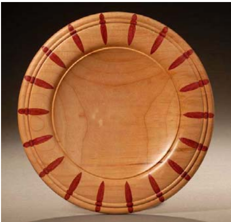
Platter with routed inlay