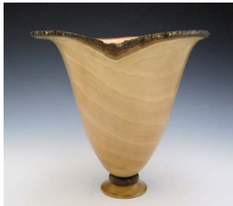
Terry Reynolds - Bradford Pear