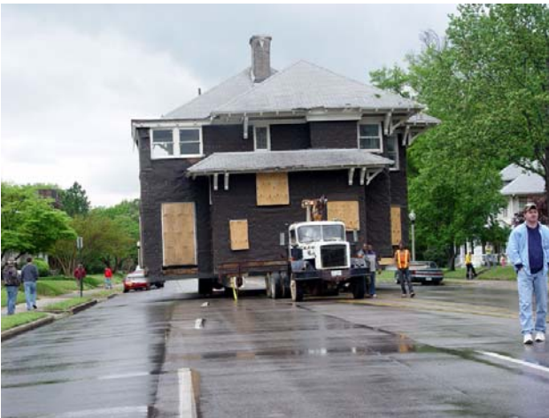
Housed being moved cuts power to April's demonstration

Mike was going to demonstrate lidded candy dishes for our April meeting but unfortunately a house that was being moved ended up causing a power outage during our demonstration.