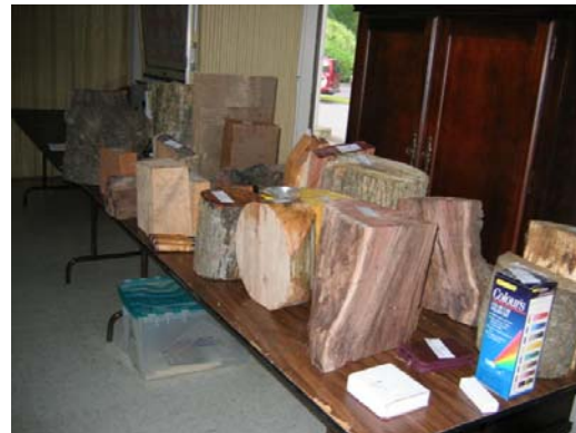
April Raffle Items

For those who haven't attended a meeting in a while we started a new program. One piece of wood from the raffle will be picked prior to the raffle and the person that wins that piece of wood has to agree to bring a finished product back to a meeting within two months. If you