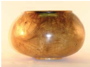
LEFT: Norm Fowler Persimmon Hollow Form