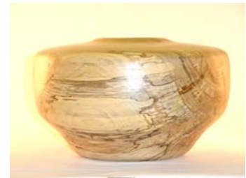
RIGHT: Joe Griggs Spalted Maple Hollow Form