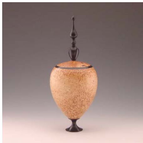
Winning lidded box with finial.