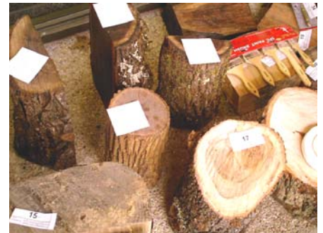
Just some of the beautiful wood brought to the January raffle...

The January raffle brought in $162. 00 for the club plus an additional $36. 00 for the auction item that Mike Kelly Donated.