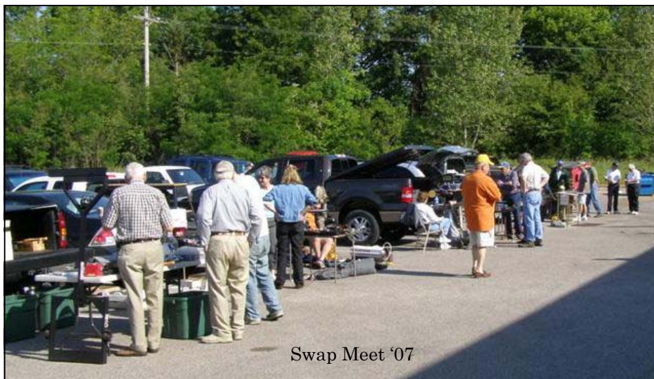
Swap Meet '07