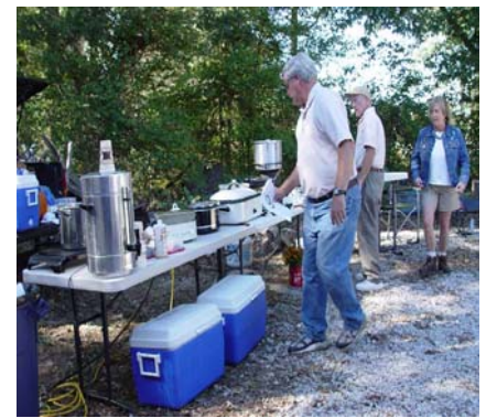
10 pots of Chili