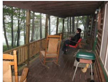
A moment of peace