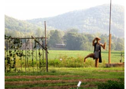
Emmett's morning salute