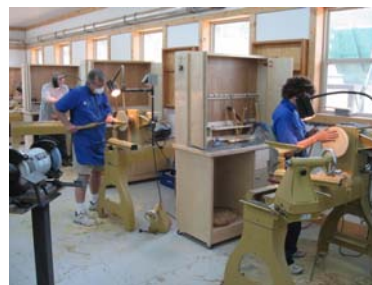
Working hard but havin' fun