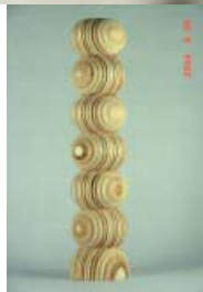
LEFT: C W Craven Bud Vase Turned from Plywood