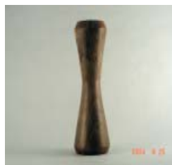
LEFT: Joe Adamson Candle Stick Turned from Walnut