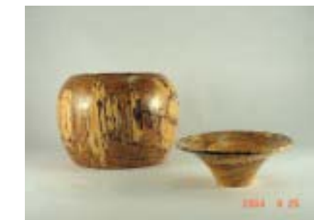
RIGHT: Larry Sefton Bowls Turned from Spalted Oak