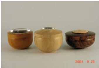
LEFT: Dennis Paullus Lidded Boxes with turned inserts Osage Orange, Ironwood, Black Limba

Our Instant Gallery had numerous items. All very beautiful and exquisitely turned. The following is a sample of items in the gallery