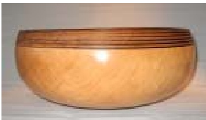
LEFT: Norm Fowler