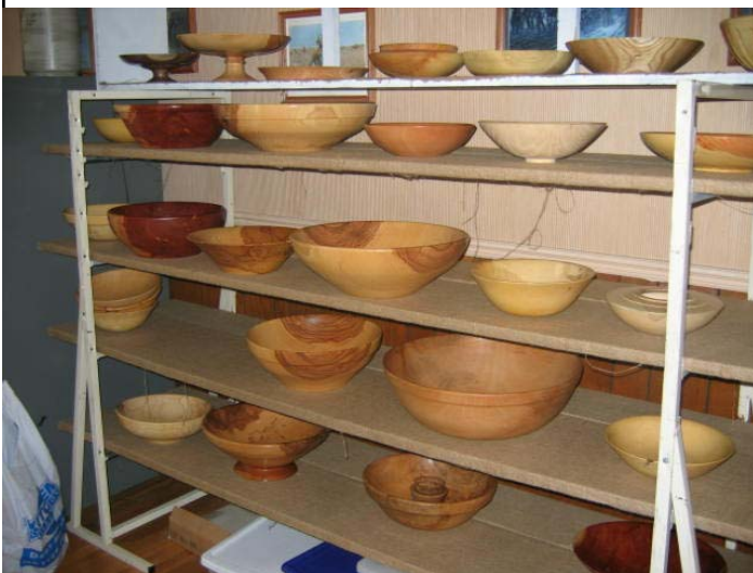
Bill's roughed out bowls

It was very enjoyable conducting this interview with Bill and I hope to get to visit with him again soon.