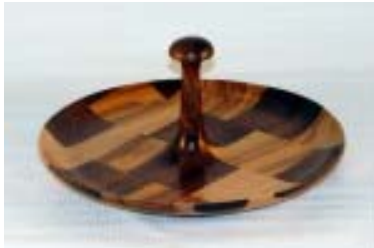
LEFT: Cecil Craven Walnut & Red Gum Mint dish