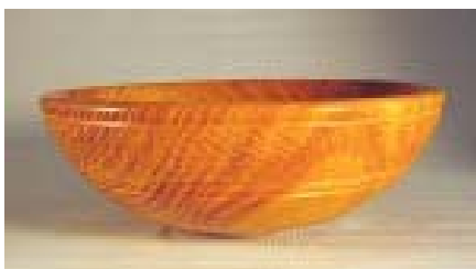
LEFT: Norm Fowler