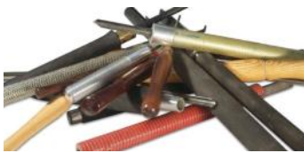
Turning Chisel Handle Scale 3/4" = 1"