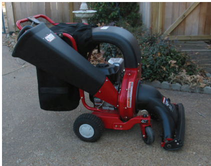
Troy - Bilt 3 in 1 Chipper, Vac Shredder

Also has 15' hose attachment for vacuuming . Five hp Briggs & Stratton, run maybe 5 times. Easy start