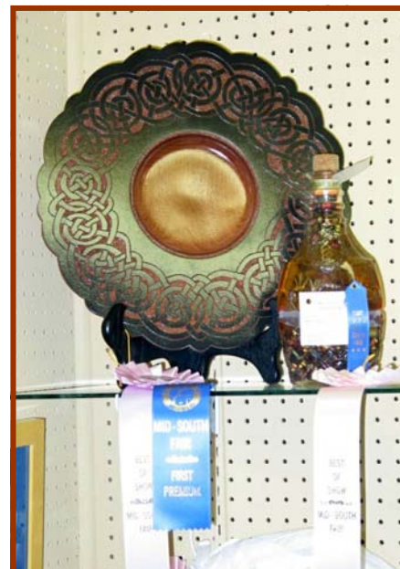
“Best in Show”